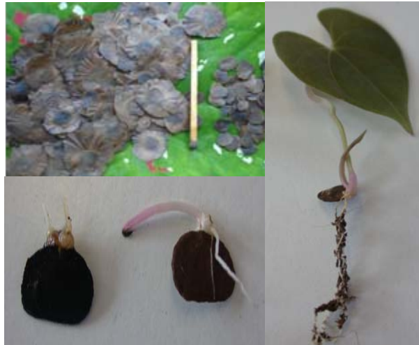
Seed we i spraut mo plant wetem 1 smol lif