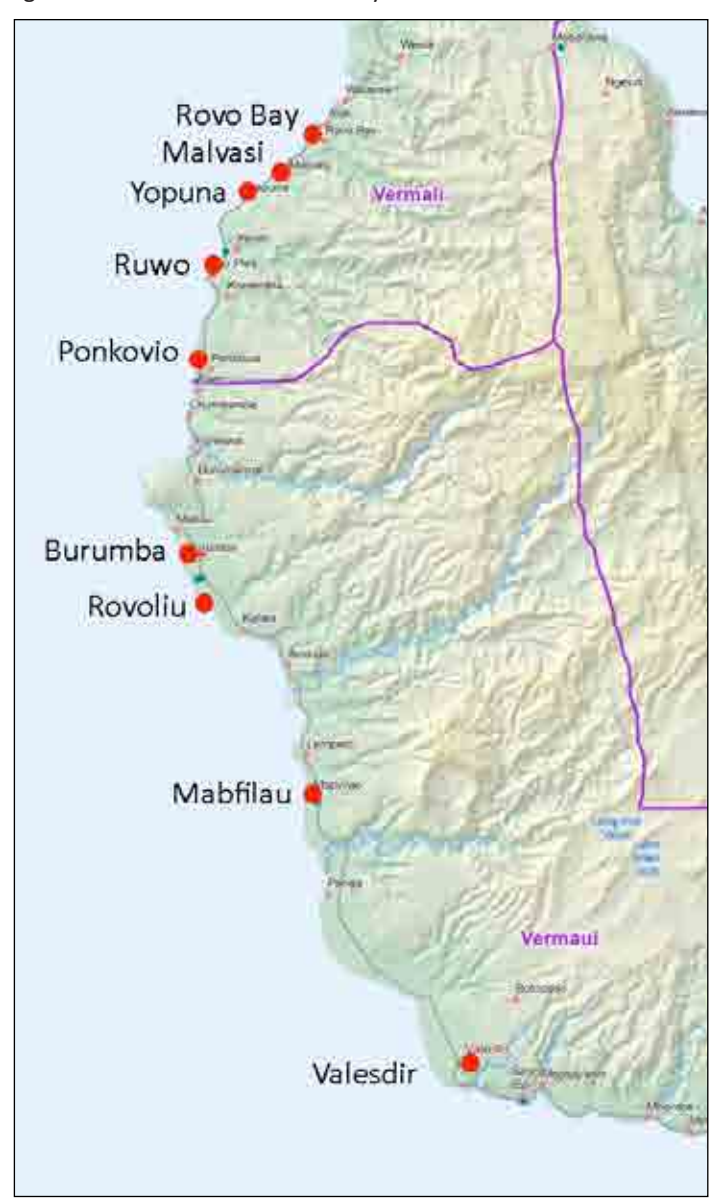
(Map of West Epi containing VCAP Project Site)

There have been multiple methodologies and templates utilized by various stakeholders to conduct vulnerability assessments and community profiles within Vanuatu, however, the Department of Local Authorities (DLA) is attempting to standardize this process. The DLA approved the use of the draft assessment tool and methodology used to collect the data contained within this report (version 2.3 of the "Komuniti Profael Form"). The vulnerability assessment tool utilized was designed using the pidgin language, Bislama, and is intended for use by non-technical Ni-Vanuatu facilitators (a generalist with a secondary level of education should be able to facilitate the assessment process