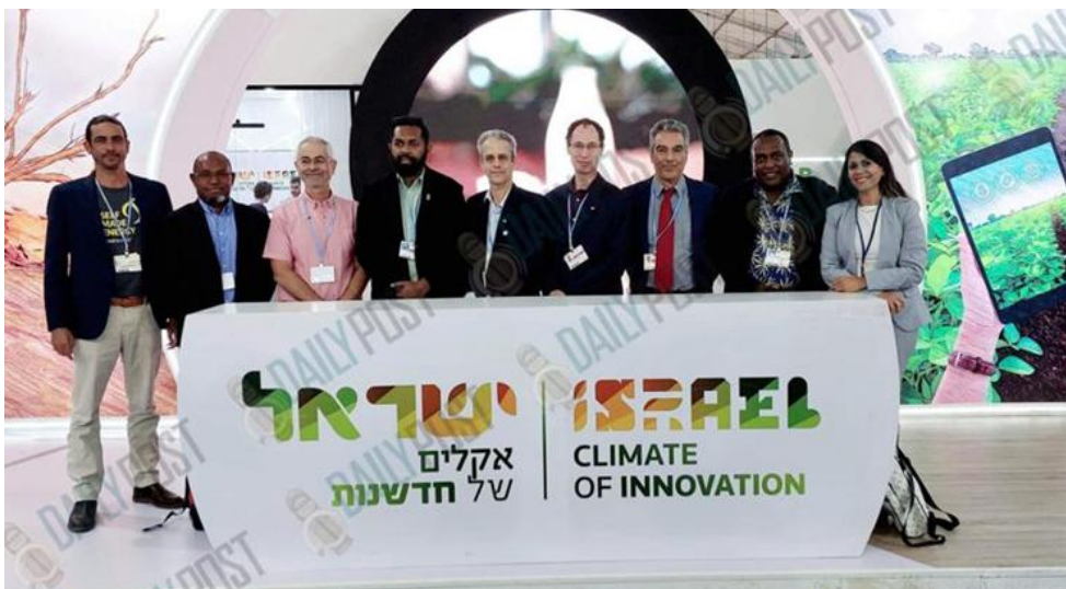
Bilateral with Israel