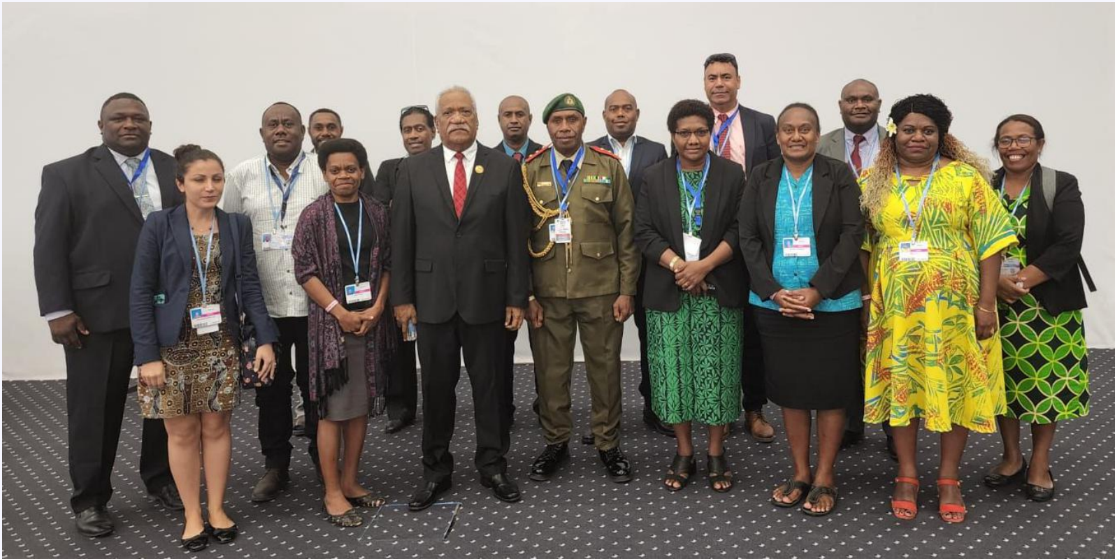
Photo taken after President Vurobaravu delivered Vanuatu's national statement

During the opening statements for the Sharm El-Sheikh Climate Implementation Summit on the 6th November 2022, there was a lot of formative and important statements presented by all delegations and stakeholder groups. Following the opening ceremony on 6 November, delegations and stakeholder groups presented their opening statements, outlining expectations for the Sharm El-Sheikh Climate Change Conference. The president of Vanuatu, The most excellency Honorable Nikenike VUROBARAVU has delivered Vanuatu Statement at the High - Level Segment. This segment is attended by the Head of States, government ministers and dignitaries from almost 200 member countries. On the 7th and 8th of November, over hundreds heads of state gathered to give speeches and engage in roundtable discussions. The six roundtables addressed food security, innovative finance, just transition, investing in the future of energy: green hydrogen, climate change and the sustainability of vulnerable communities and water security.