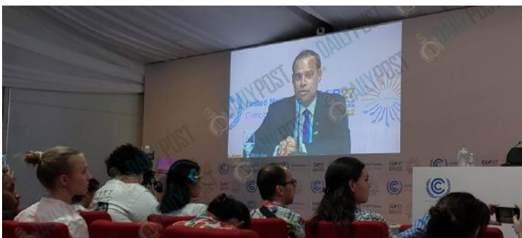
Honorable Ralph Regenvanu speaking at the ICJAO Press Conference