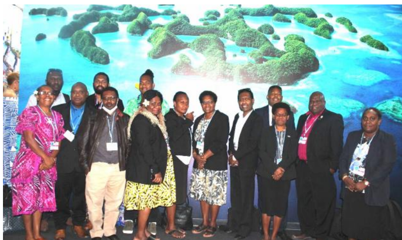
After another side-event session at the Moana Blue Pacific Pavilion