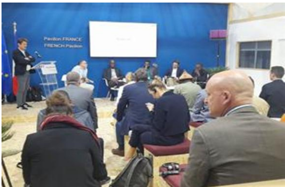
Vanuatu highlights carbon neutral strategy at COP27