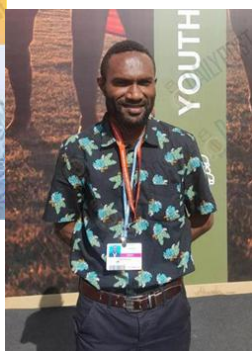
Vanuatu youths at COP27