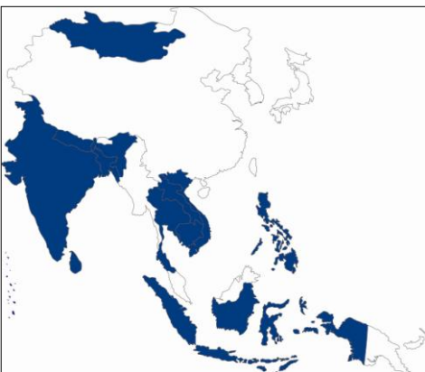
■ Eligible Asian nations