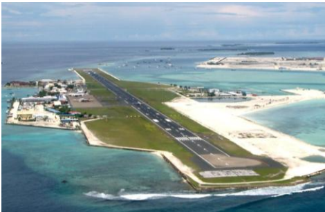
Scientists believe that Asian countries are particularly vulnerable to rising sea level and extreme weather events.